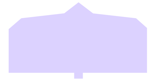
Trennwandfläche: 105.68 m 2